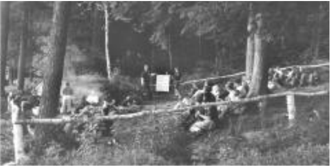
Tree Talk, part of Birch Rock since 1926